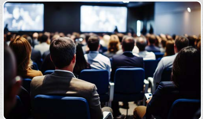
OTHER SERVICES PROVIDED