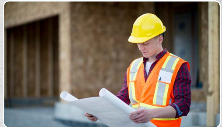
PRECONSTRUCTION AND PERMITTING